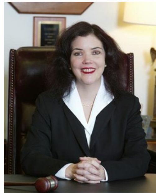
HON. JUDITH A. HARD

New York State Court of Claims Equal Justice Committee